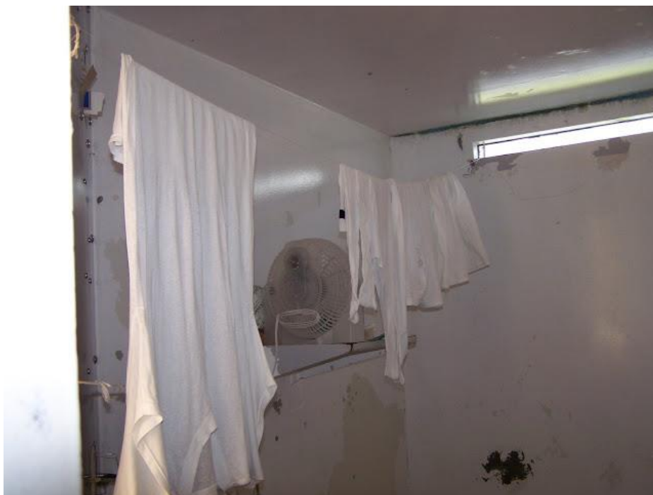
Figure 3: Small Fan in Inmate Cell 35

Deadly Texas prison temperatures have been a long-standing, ongoing issue in TDCJ-run facilities, and the TDCJ is well aware of this issue. For example, at least sixteen Texas prison inmates experienced symptoms related to hyperthermia in the summer of 1998, three of whom died from their symptoms. 36 Many of those inmates had preexisting health conditions and were receiving psychotropic medications, yet were housed in units that were not cooled to their medical needs. 37 Over the years, TDCJ facilities seem to have seen little improvement, completely disregarding the rights and dignity of its inmates. Since 2007, at least fourteen inmates have died from extreme heat 38 in nine different TDCJ prisons. 39 All fourteen inmates had preexisting health circumstances that rendered them more vulnerable to heat-related illnesses, such as obesity, diabetes, and history of hypertension. 40 41 Thirteen of the fourteen