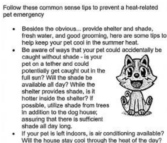
Figure 4: TDCJ Risk Management Department: Injury Prevention—Heat Awareness Training 91

distributed among TDCJ employees to manage risk and to raise awareness in TDCJ prisons, the TDCJ admits that risks for heatstroke can begin at temperatures as low as 91 °F, and that temperatures of 95 °F can create an imminent danger of developing heatstroke. 89 Despite this training, the TDCJ has failed to adopt comprehensive measures to prevent or minimize risk of heat-related injury. The Risk Management Department has even trained its employees in heat injury prevention for their pets, asking employees if their homes were air conditioned and if fresh, cool water was available to their pets at all times. 90 Unfortunately for TDCJ inmates, these measures are not made available to them in their cells, and temperatures in TDCJ-run correctional facilities continue to pose a threat to the lives of TDCJ inmates.