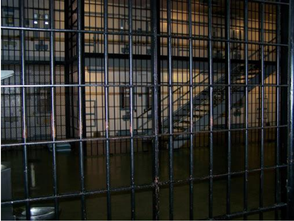
Figure 5: Polunsky Unit, Livingston, TX 173

Although persons who are incarcerated have been deprived of their right to liberty, these individuals still retain most of their fundamental human rights, most notably the rights to dignity, life, security of person, 174 the right to be free of inhuman or degrading treatment, and the right to health. 175 Nearly every body of human rights law includes provisions specifically for the protection of prisoners' rights. 176 The fact that this idea has such universal support demonstrates that guaranteeing the protection of basic rights of inmates has become part of customary international law, which comes from a general and consistent practice by other nations. In briefs submitted to the Inter-American Commission on Human Rights (IACHR), the United States has relied on the concept of customary international law, showing that the the United States accepts the binding nature of customary international law. 177