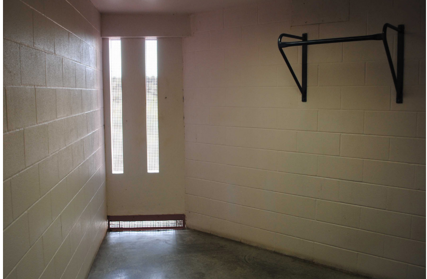
Exercise room at Colorado State Penitentiary for ad seg prisoners