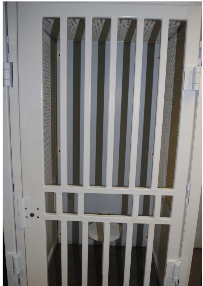
A closer look into the group therapy cages