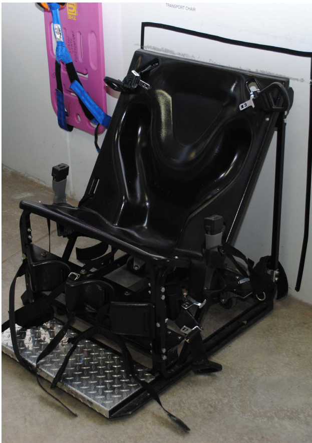
Restraint chair for transportation within Colorado State Penitentiary

John’s story lends credence to the wide and growing consensus among psychiatrists that isolation is predictably damaging to seriously mentally ill prisoners. In December 2012, the APA adopted a position statement against segregation of prisoners with serious mental illness. 14 Specifically, the APA espoused that “[p]rolonged segregation of adult inmates with serious mental illness, with rare exception, should be avoided due to the potential for harm to such inmates.” The APA clarified that “prolonged segregation means duration of greater than 3-4 weeks” and explained that “placement of inmates with a serious mental illness in these settings can be contraindicated because of the potential for the psychiatric conditions to clinically deteriorate or not improve.” 15