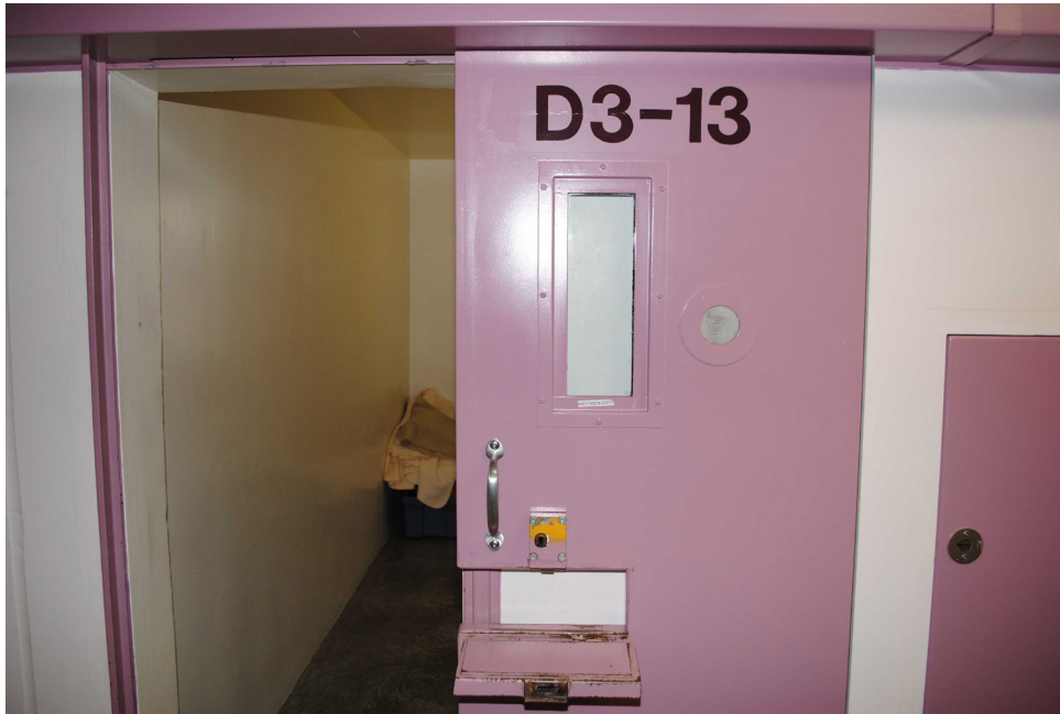
An administrative segregation cell for mentally ill prisoners at Colorado State Penitentiary

For most prisoners in administrative segregation, being handcuffed through their cell doors is the only physical human contact they receive.