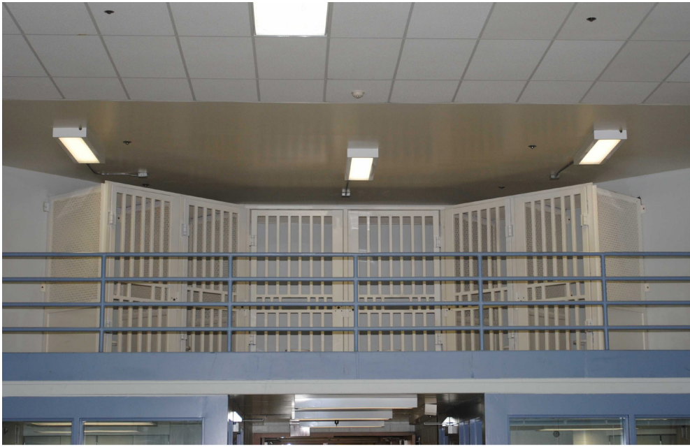
Group therapy cages for mentally ill inmates fortunate enough to be granted therapeutic out-of-cell time