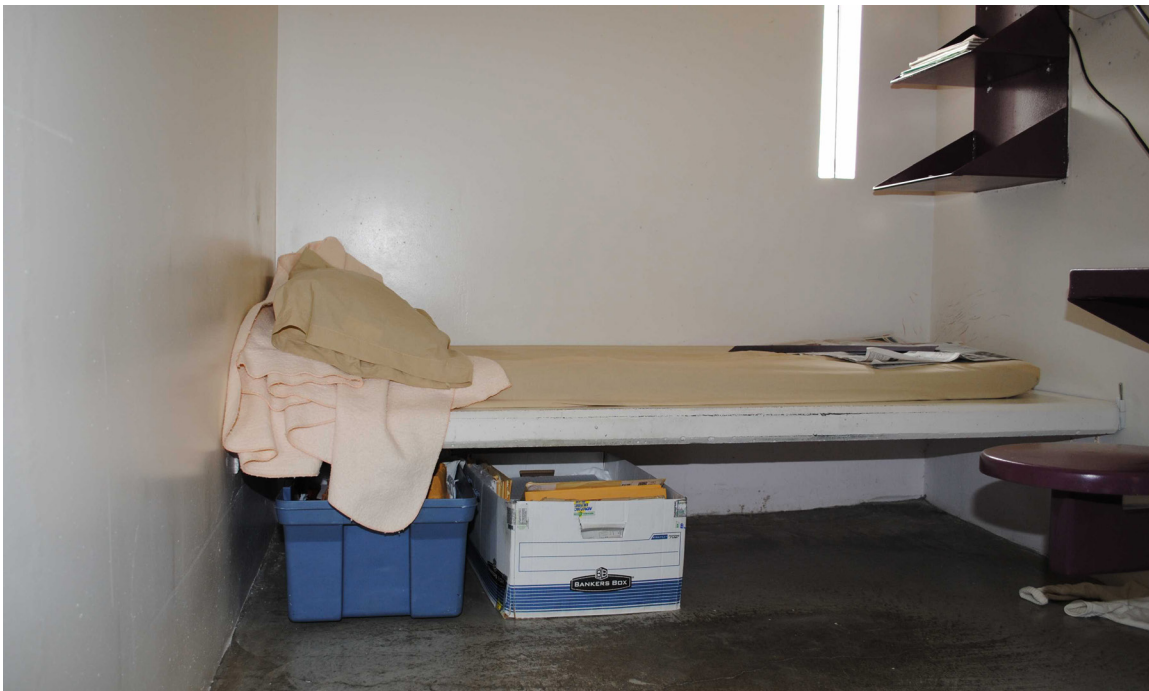
Administrative Segregation Cell