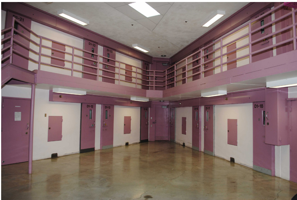
Colorado State Penitentiary Administrative Segregation unit

Similarly, in 2001, the federal court considering conditions at Wisconsin’s Supermax Correctional Institution noted “[m]ost inmates have a difficult time handling these conditions of extreme social isolation and sensory deprivation, but for seriously mentally ill inmates,