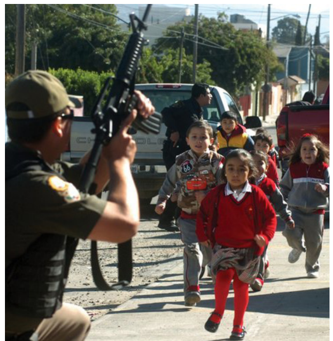
Schoolchildren fleeing drug-related violence in Tijuana, Mexico

Throughout Latin America, but also in Central Asia and West Africa, long-running civil wars and decades of poor governance have been exacerbated by the war on drugs. An estimated 95% of illicit drug production occurs in such areas, and trafficking from and across them is made easier by their chaotic environment. 22