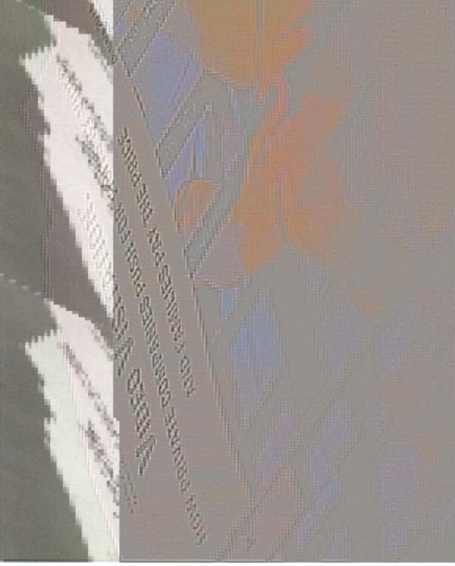
Last year the Travis County Jail did away with in-person inmate visitation and now uses a video visitation system similar to Skype that burdens families with costs. This week, the Bastrop County Jail followed with a similar system.

Just last month, inmate advocates in Austin called on sheriff's officials