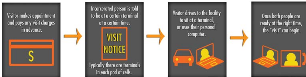
Figure 1. Most companies, including Securus, Telmate, and Renovo/Global Tel*Link, charge for a set amount of time and require pre-scheduled appointments.

How do video visitations work? While video visitation systems vary, the process typically works like this: