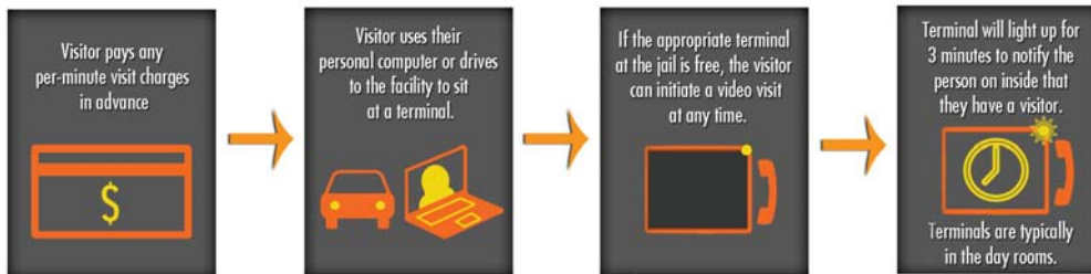
Figure 9. TurnKey charges per minute and allows the visitor to call into the facility without an appointment.

Two companies, Turnkey and HomeWAV, structure their systems differently than the market leaders and structure them more like phone services. Both charge per minute rather than per visit, and neither company requires families to pre-schedule video visits: