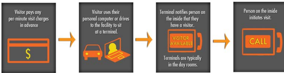
Figure 10. HomeWAV charges per minute and does not require appointments. The visitor says when he or she is available, and then the person on the inside makes an outgoing video call.

HomeWAV told us that the average length of a visit on their system is 5.79 minutes, significantly fewer than the standard visit blocks of 20 or 30 minutes. By charging per minute, families are incentivized to use video visits for shorter time periods. For example, it is possible for a daughter to say goodnight to her incarcerated father or for a husband to ask his wife if she received her commissary money via video visit, without the visit being financially burdensome.