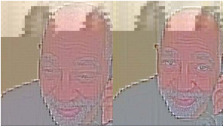
Figure 4. This image is from a video demonstrating that eye contact is important for human communication. (For the video, see http://www.prisonpolicy.org/visitation/report.html )