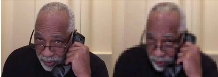
Figure 3. Visual acuity is important for human communication.

their bodies. It's an accountability thing, and lets people on the outside get some read on the physical condition of a loved one." 20